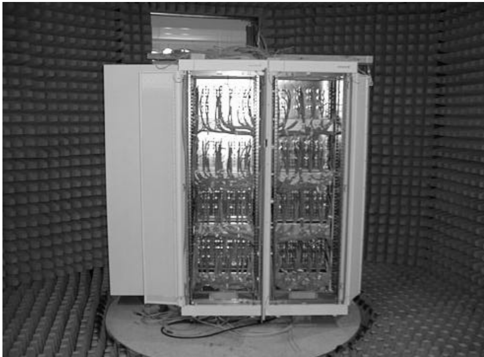
GSS64K Back side open doors.